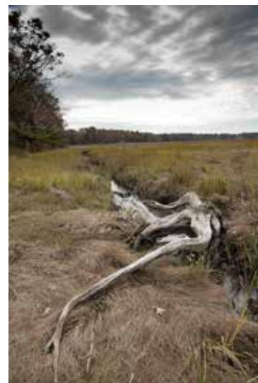
Deep Meadow 1