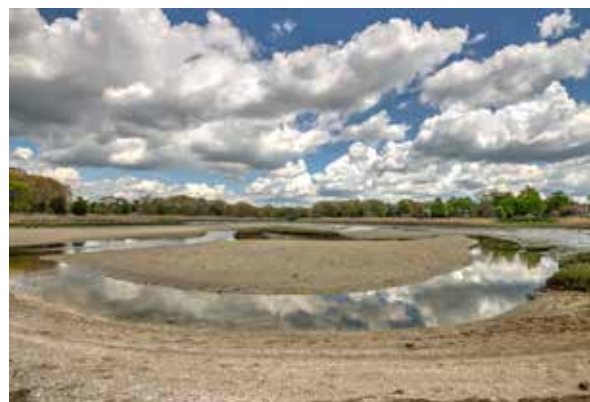
Allin's Cove (No. 16)