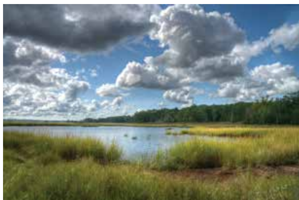
Johannis Wildlife Refuge 2