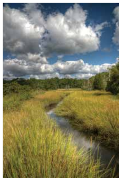
Johannis Wildlife Refuge 4