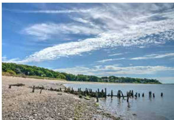
Mussachuck Creek 2