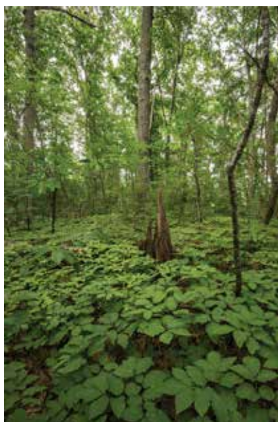
Sowams Woods 3