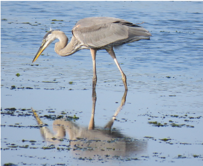
Great Blue Heron at Osamequin.