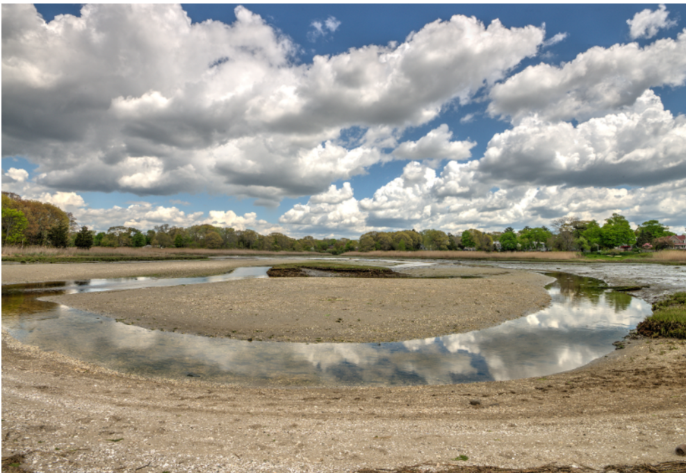
Allins Cove.