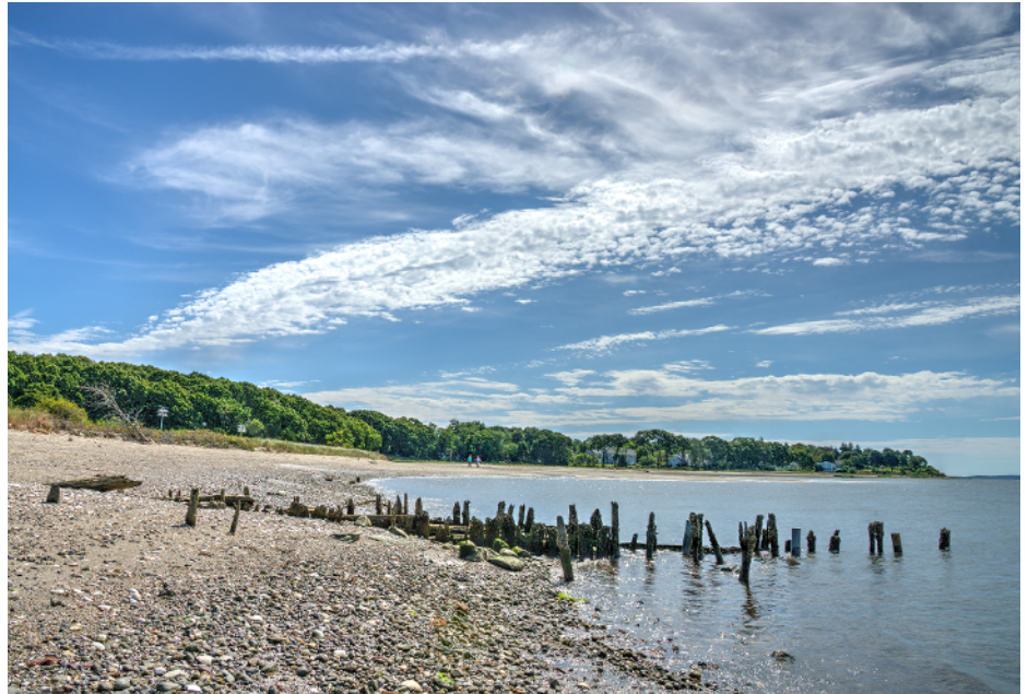
Mussachuck Creek.