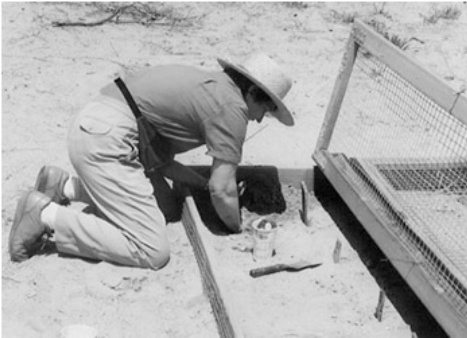
Charlotte at Predator Excluder Box.