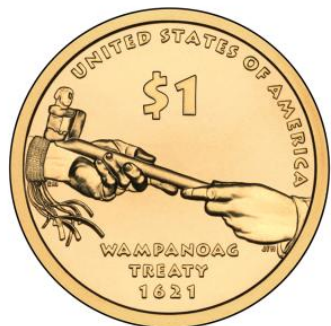
Image is the design of a $1 gold coin commemorating the peace treaty between Plymouth Colony and the Wampanoag Tribe in March 1621.