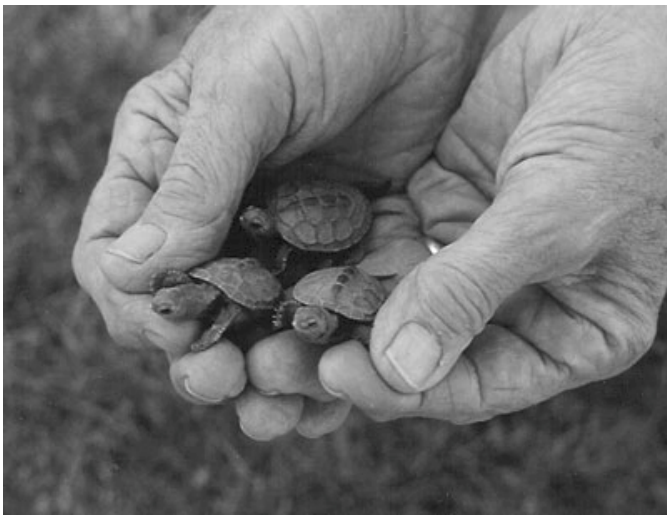
These babies are ready to go to the water.

For more information about the Diamondback Terrapins, look on the Land Trust website, www.blct.org .