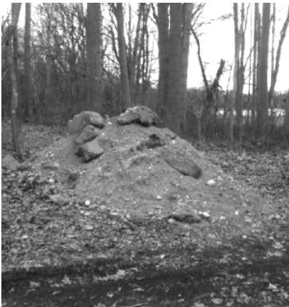
Dumping at Sowams Woods